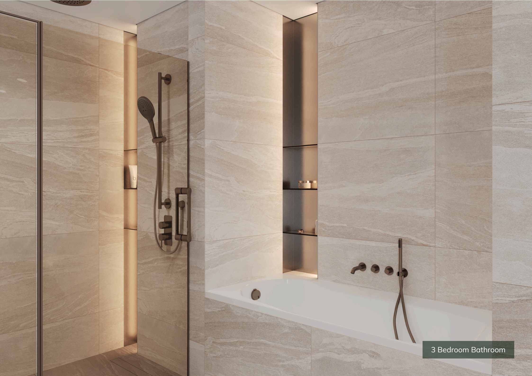
3 Bedroom Bathroom