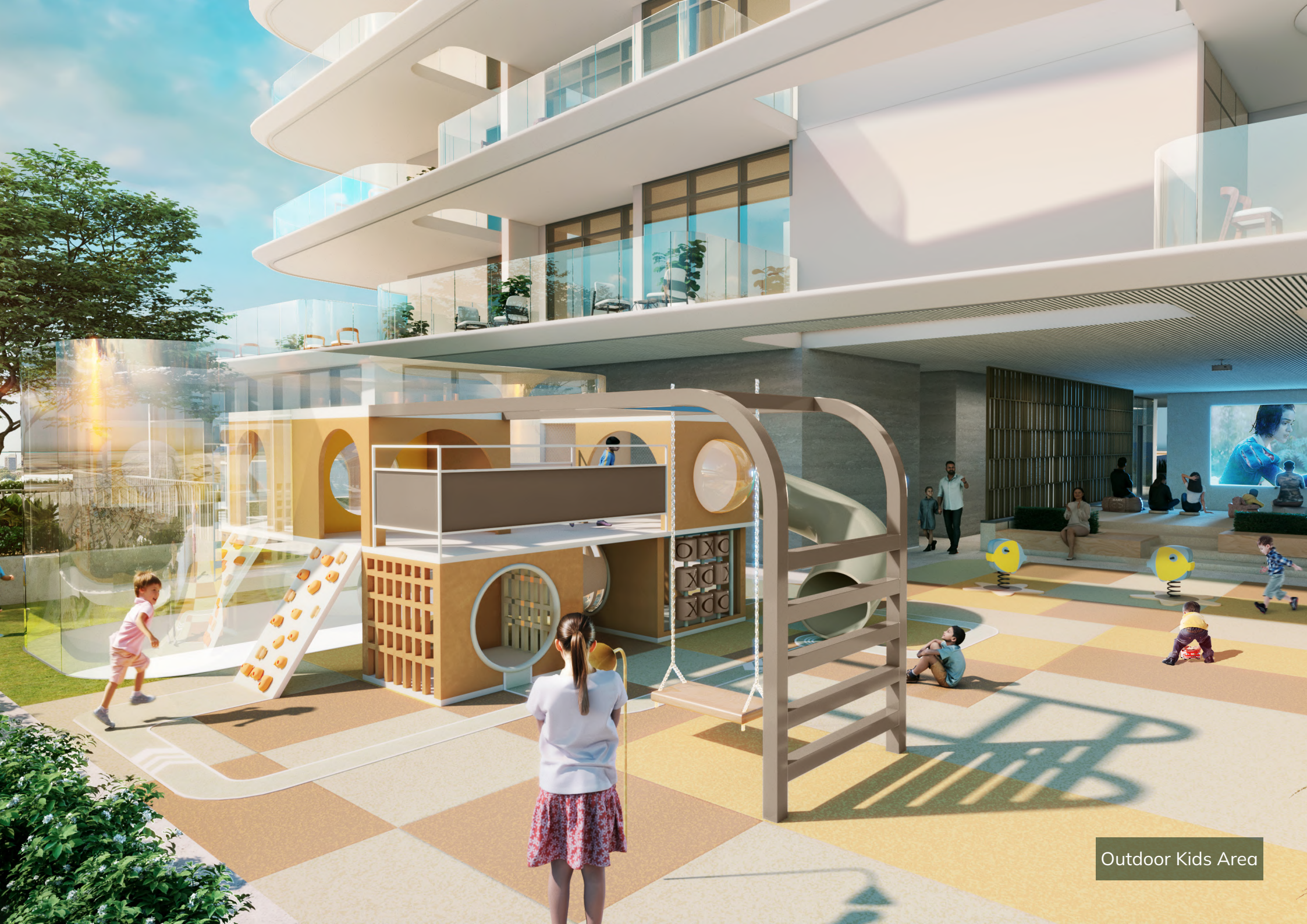
Outdoor Kids Area