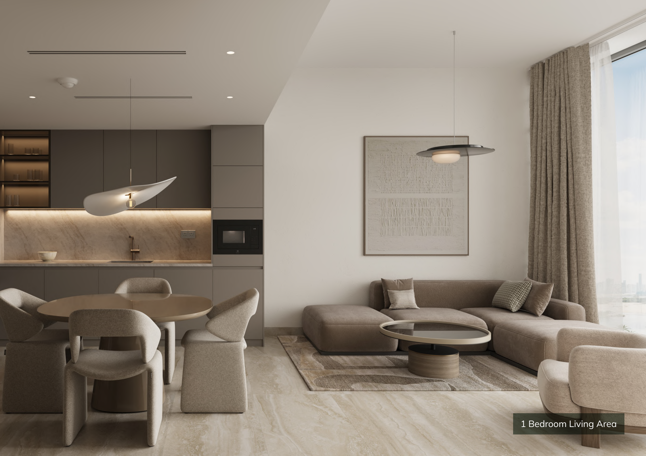
1 Bedroom Living Area