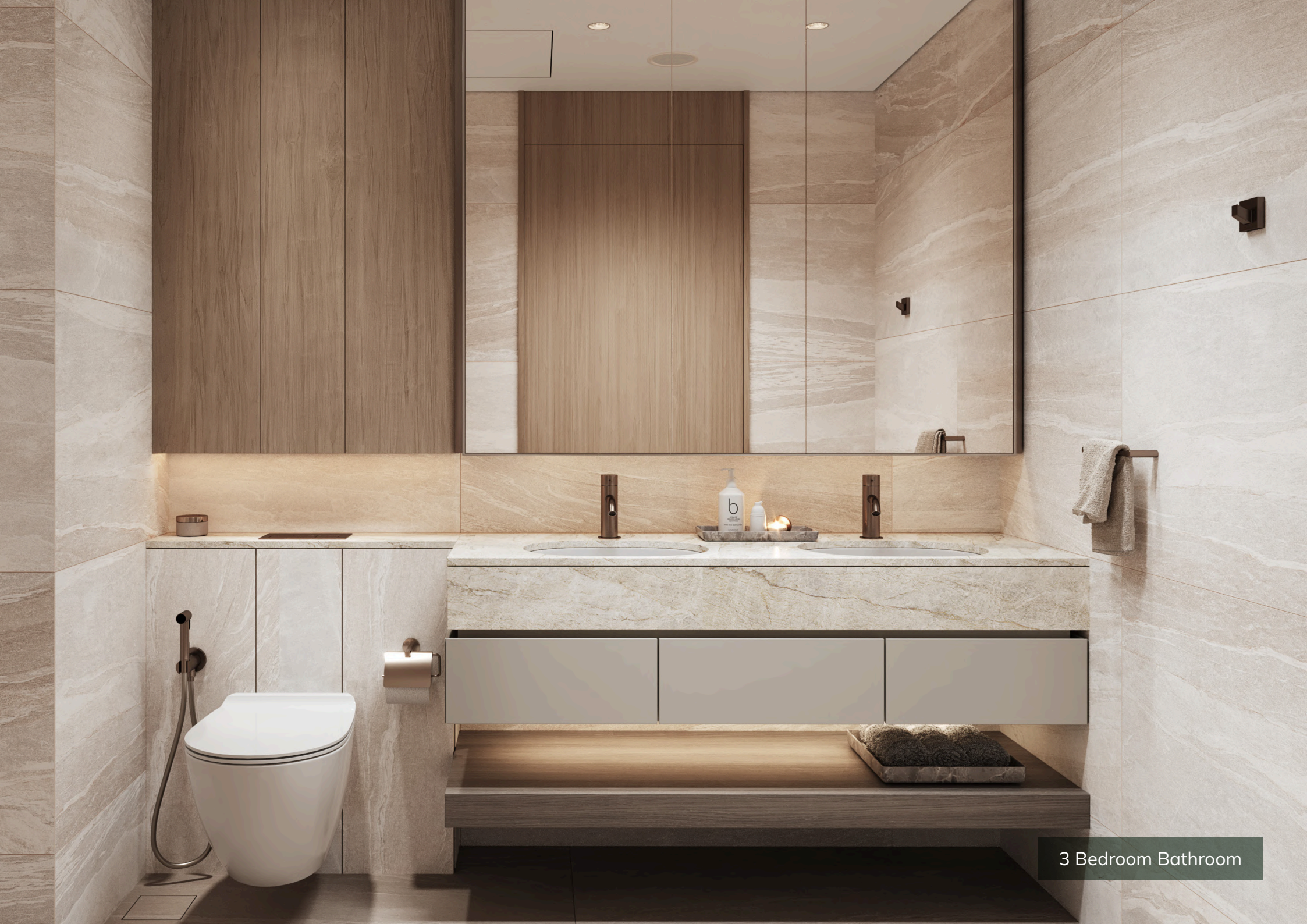
3 Bedroom Bathroom