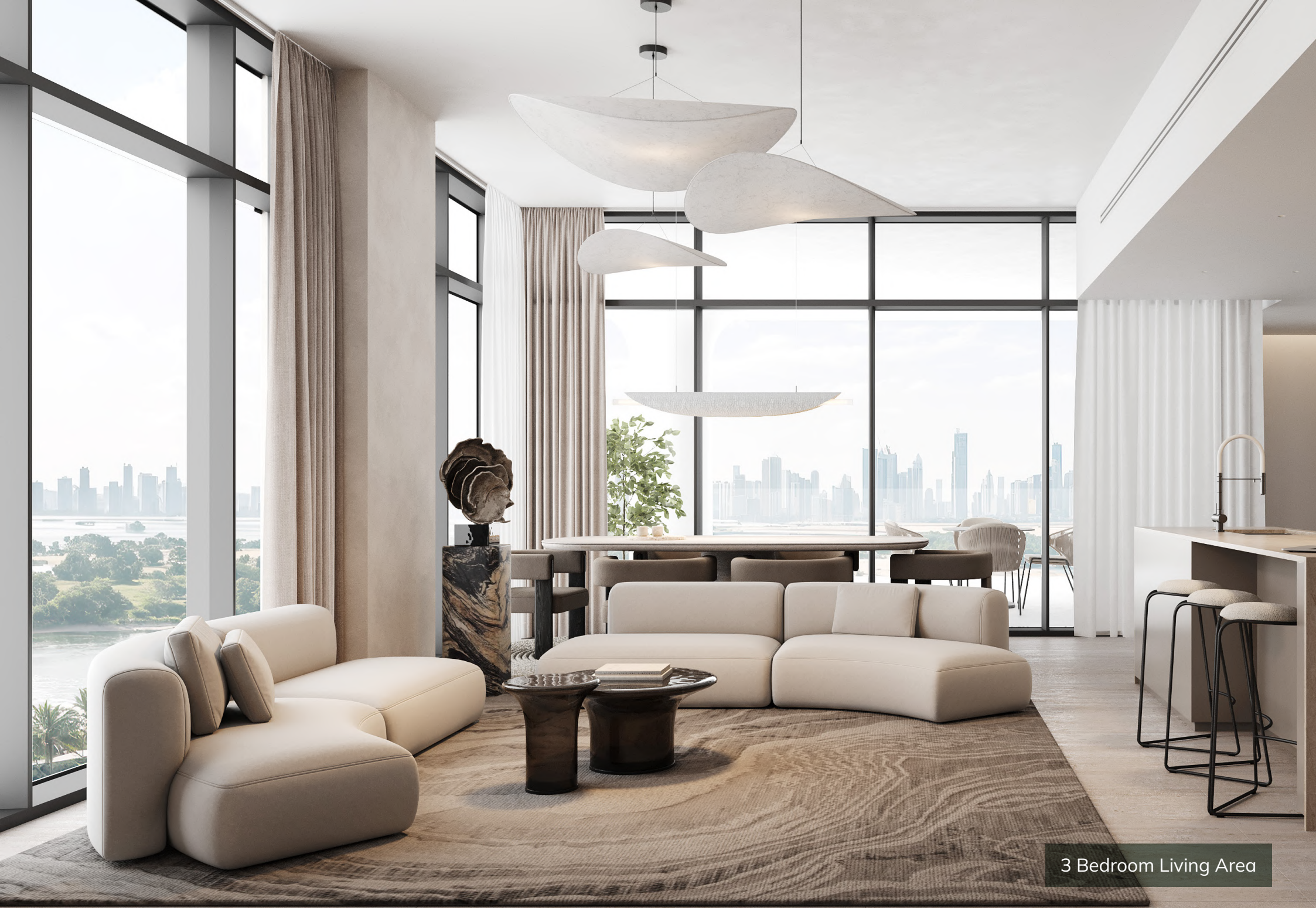
3 Bedroom Living Area