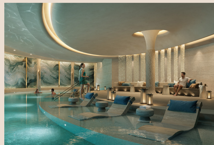
Wellness Centre and Clubhouse