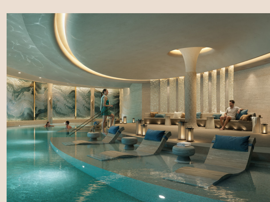
Wellness Centre and Clubhouse